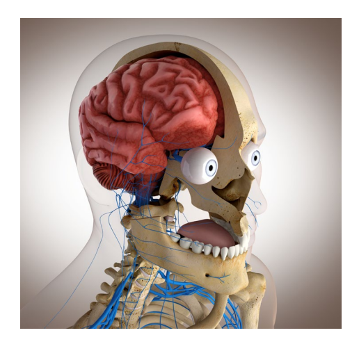
The optical nerve is connected to the optical centre at the back of the brain.